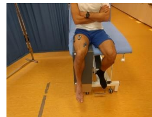
Figure.3 Kinematic Analysis